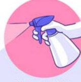
Clean and disinfect