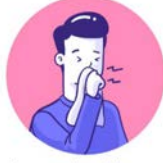
Cover coughs and sneezes