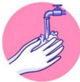
Clean your hands often