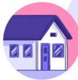
Stay at home