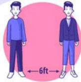
Avoid close contact

DHD COVID-19 Page - link Michigan's COVID-19 Page - link CDC's Holiday Guidance - link The Detroit CoC's COVID-19 Site - link Register for Upcoming Webinars here